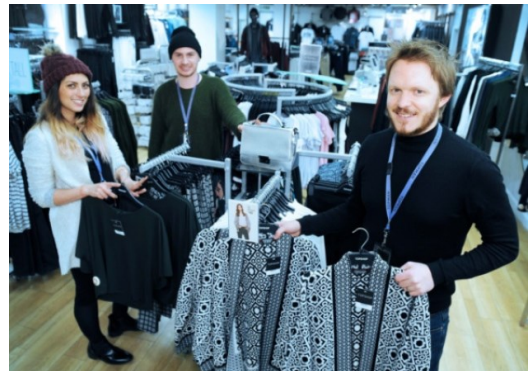
Retail staff who are asked to wear the company's own clothes can not claim a tax deduction for those clothes.

If you're unsure about the tax deductibility of your work related clothing, we invite you to contact us to discuss the rules and regulations.