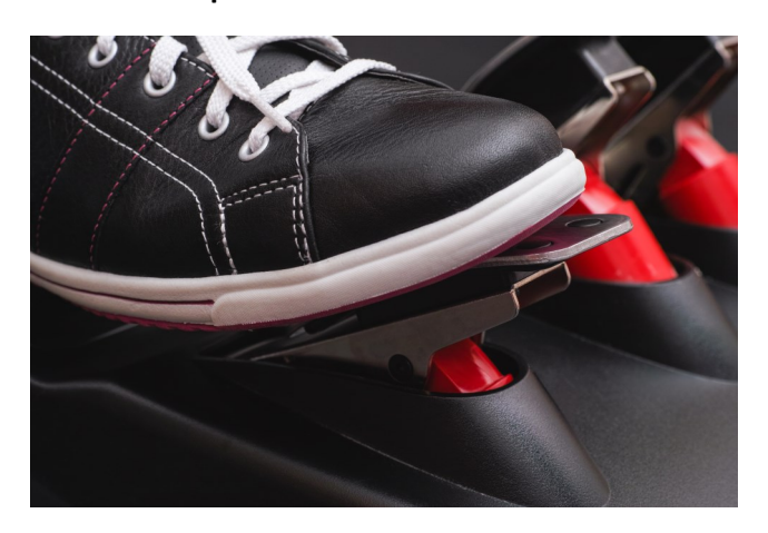
Error 3: Keep Your Foot on the Pedal

Another big mistake vendors make when they decide to sell is taking their foot off the pedal. They relax, scale back their marketing spend, and the business slows. As you know, it can take months or even years to sell a business and buyers will gravitate away from a business in decline or they will look to negotiate the price down.